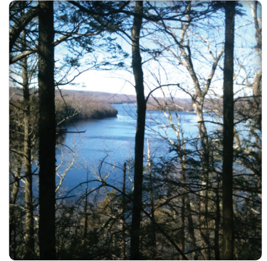
Trout Brook Valley view.

We are conducting a wildlife survey and forest management plan in Trout Brook Valley to better understand the flora and fauna that exist there. A survey of wildlife has never been conducted within the 1,009 acre preserve and will help us to better understand how to manage the property for wildlife and our human visitors. Funding for the wildlife survey was provided by a grant from the Connecticut Land Trust Challenge Fund administered by the Land Trust Alliance in partnership with the Connecticut Land Conservation Council. Funding for the forest management plan is being provided by the Environmental Quality Improvement Program administered through the Natural Resource Conservation Service. For more information please visit our website.