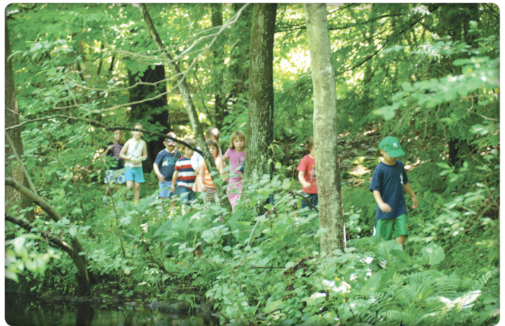
Short Hike Participants, Stonebridge Waterfowl Preserve, Weston

Did you know that children now spend 53 hours per week with technology and that the average teen sends 3,000 text messages per month? Scientific studies are now documenting what many parents already know: getting kids outside is good for them. To get more kids outdoors, we built a Natural Playground for Children at the Leonard Schine Arboretum in Westport and started a hike series for kids, Short Hikes for Short People. See our website for more information on how you can connect your children with nature.