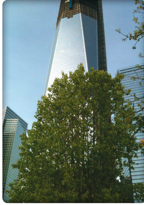
The Survivor Tree, 9/11 Memorial. Freedom Tower in background.

2011 was a great year for the Aspetuck Land Trust! More people joined the Land Trust than in any previous year in our history, and we preserved two new properties totaling 73 acres.